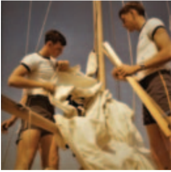
Sailing on the Knockabouts.