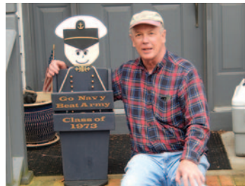
Our newest classmate, Midshipman Door and me!