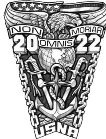
The Crest for the USNA Class of 2022

officially recognized its ALITC sponsor in so lasting and conspicuous a manner. Our appreciation and continued best wishes to the Class of 2022 as they move forward to Youngster Year!