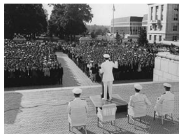
The Class taking the Oath of Office 30 June 1969

I think we can say we are officially in our 50th anniversary countdown. Over the next four years I'll try to add some pictures and stories of our time at the Academy. Maybe some of the stories behind famous sayings like; "They can't fry us all!" If I remember correctly THEY did! I thought it would be fun to put some pictures in of our first day at the Academy. If you would like to share any pictures or memories you have please send them on. Here are a couple of great photos.