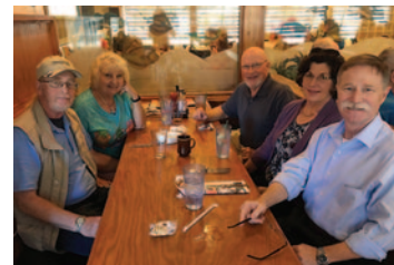
30th Company Mates