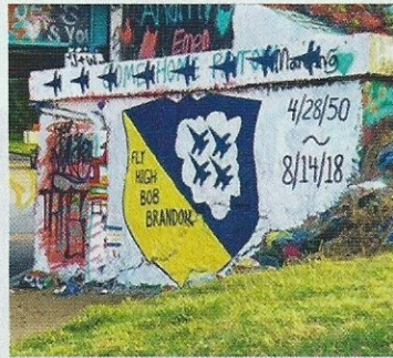
Graffiti Bridge in Pensacola, FL

We also learned that we lost two more classmates back in 2014.