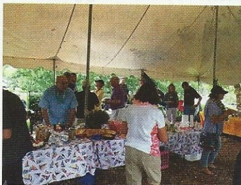
The Staff Corp's Navy-Memphis tailgate party