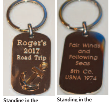
Embrace of Friends Embrace of