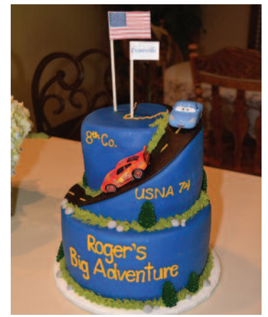
Standing in the Embrace of Friends

I am not injecting much of our 8th company reunions from this trip. But as a result of the general joy and comradery experienced, my cup truly runneth over. Attached are some photos that illustrate the welcome I received as I rambled from company mate to company mate.